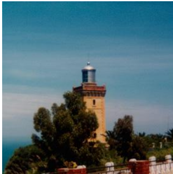
The rather attractive square lighthouse