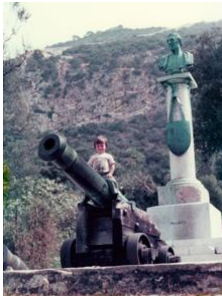
A final fling with a rather large cannon

After that we walked around Main Street and did some last minute shopping that included a filter for Alan's camera and some Scholl sandals for me, before returning to the flat for lunch.