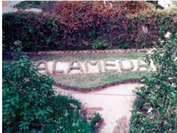
Just in case we forgot the name

The Alameda Botanical Gardens had been created in 1816 under the instruction of the Governor of Gibraltar, as a peaceful area of recreation for the garrison then stationed on the Rock. We could see many interesting shrubs and flowers and the heat combined with the unusual planting created a pleasant, evocative smell. I particularly liked a pepper bush that was at the edge of the garden, hanging over the wall close by the pavement.