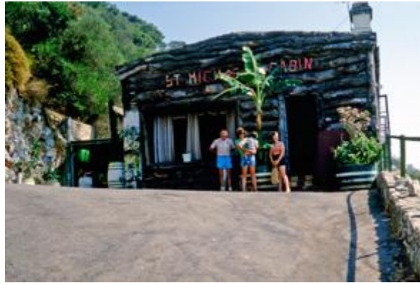
Outside St Michael Cabin