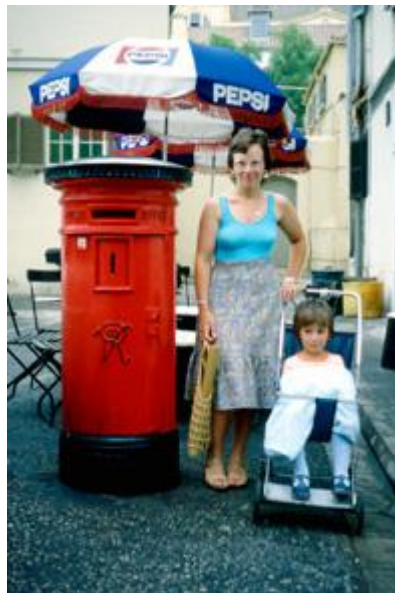
Two tourists by a Victorian (VR) postbox

Daniel woke at 07.10 - it seemed very muggy this morning on my final day of being 26. Derek went into the Dockyard at 08.00, but returned at just gone 10.00 and drove us all into Main Street, where we split up to pursue various shopping activities.