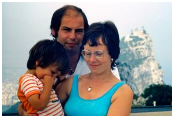
A strange one to end with...