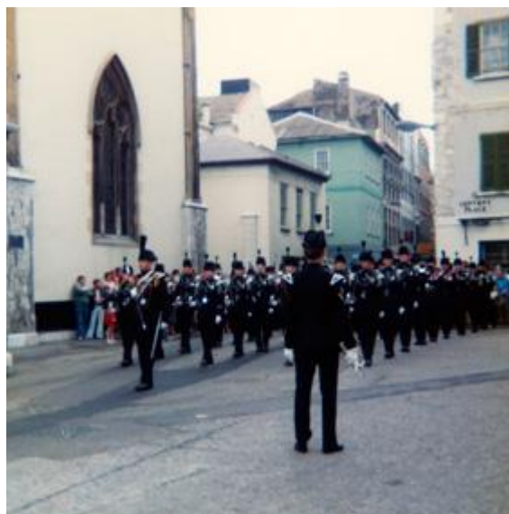
The Main Street parade