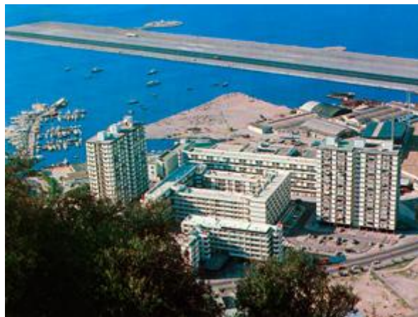
The runway into the sea

We quite soon arrived at Princess Caroline's Battery and looked out once again over the landing strip. It seemed even hotter than before and was very hazy - which may have contributed to my failed attempt at taking a movie of the plane that came in to land, as I didn't spot it until it was almost down. Foiled again!