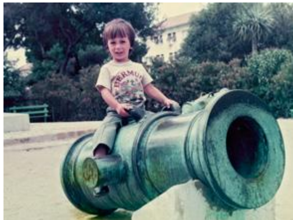
Just the right size!