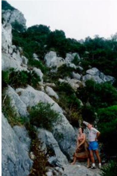
Derek and I gaze upwards

We carried on, stopping at a few places to look at the view below and some gun emplacements used during the war. Eventually we reached the clouds and then the top of the Rock, which to my mind is no small feat. There were aerials for the communication station there, although entry was naturally prohibited.