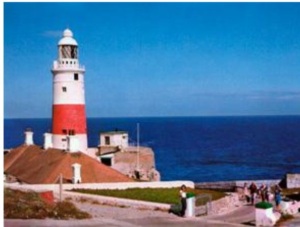
Europa Point lighthouse