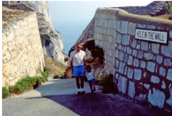
Where is the hole, Grandad?